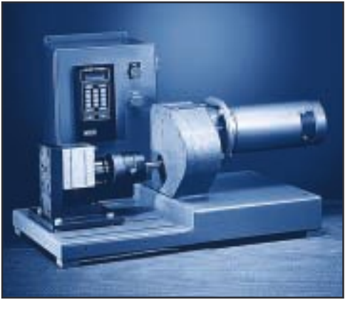
Standard ZeDRIVE with 1/2 hp QM and rear-port HMB pumps.

In 1926, Zenith Pumps was approached by the synthetic fiber industry to design a pump to provide a precise, pulseless, repeatable flow and assure better quality control. The options then were the same as those in the chemical process industry