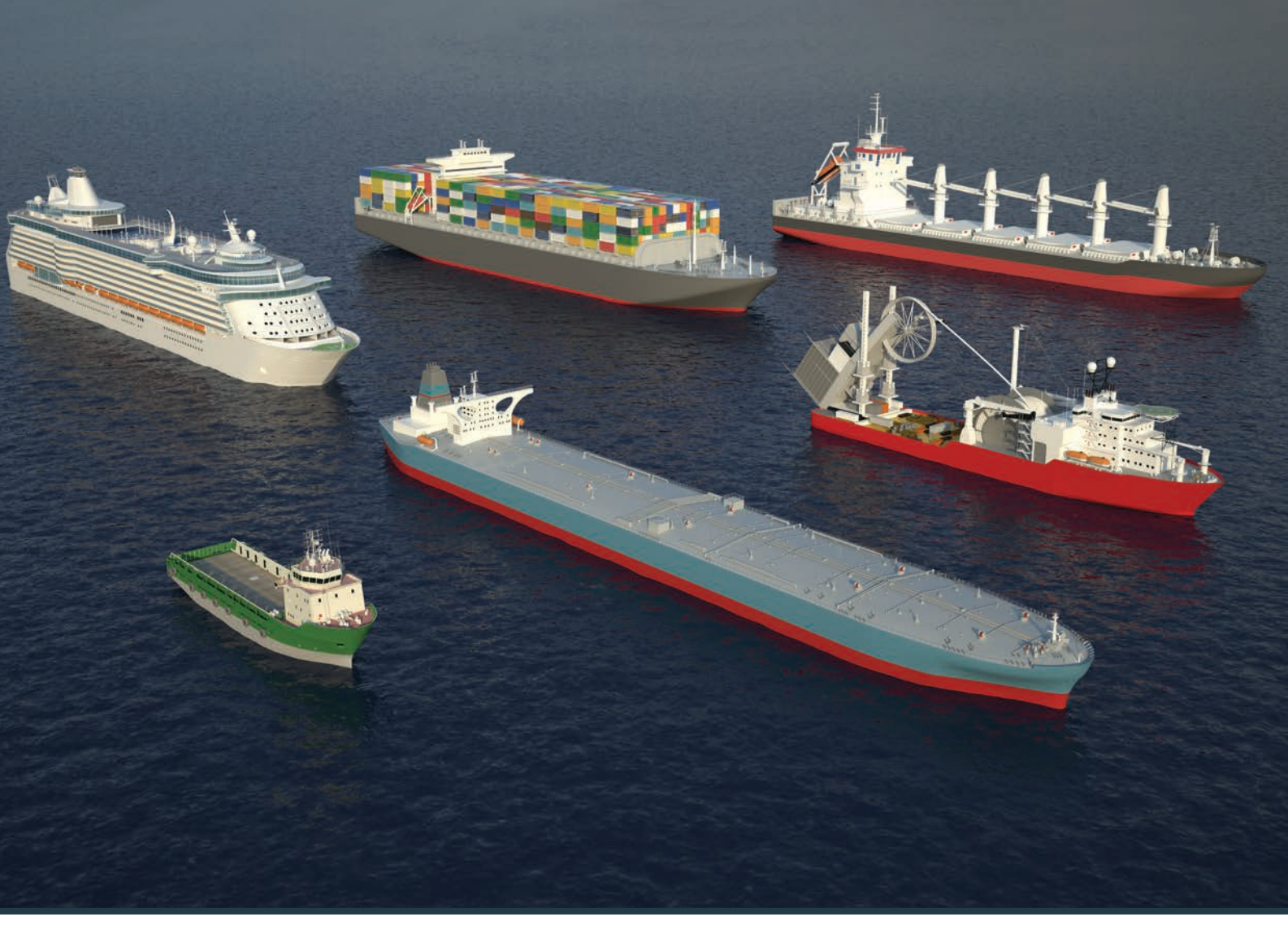
CRUISE VESSELS CONTAINER VESSELS BULK CARRIER VESSELS OIL TANKERS OFFSHORE SUPPLY VESSELS PLATFORMS/RIGS SPECIALIZED VESSELS