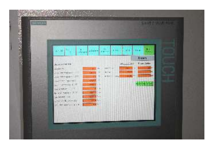
In nearly 7000 operating hours, there has been no recorded loss of performance and no failures. Allweiler® anticipates another 15,000 operating hours before the first maintenance.

Materials selection and optimized dimensioning of the pump unit are important requirements for disturbance-free operation. Technical design characteristics that match the pumped liquid are also important considerations. In addition to energy consumption, low costs for spare parts and maintenance are decisive for maintaining economical operation: Allweiler® is one of just a few manufacturers that makes its own stators and rotors. As a result, Allweiler® specialists can select from 20 different stator elastomers and find the right combination that matches the chemical and physical characteristics of the pumped liquid and ensures the longest possible service life. This results in long maintenance intervals, minimal downtime, and very reliable, continuous operations. The discharge pump has already been in operation for 7000 hours without detectable wear. The manufacturer currently anticipates that the pump will complete 15,000 to 20,000 operating hours before needing overhaul.