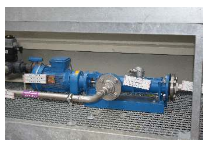
Allweiler® progressive cavity pump used as metering pump.