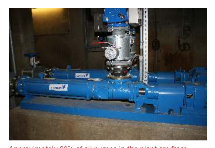
Approximately 80% of all pumps in the plant are from Allweiler®, including the thin sludge pumps in this photo.

The Duisburg-Kasslerfeld sewage plant is the largest in the Ruhrverband, a non-profit water management company serving the Ruhr and Lenne catchment areas in western Germany. Approximately 50% of the wastewater volume comes from households, with the remainder from a variety of industrial operations, including tank cleaning, beverage production and the Duisburg Zoo. In recent years, plant operators decided to replace the chambered filter presses with two centrifuges. During the course of the conversion, the plant set up two systems for discharging drained sludge to compare reliability and efficiency: a centrifuge with an inclined conveyor and a centrifuge with a progressive cavity pump from German manufacturer Allweiler®, which is part of the American firm CIRCOR International, Inc. (NYSE: CIR), since late 2017. According to Dipl-Ing. Ralf Wilms, Operational Group Leader in the West regional zone of the Ruhrverband, "We wanted to know whether a discharge pump would be a more economical and reliable solution than a conventional inclined conveyor."