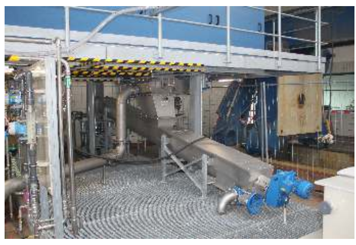
The inclined conveyor moves sludge from the top into the silo.

special pump design does not require a bridge breaker, and the pump's design height is significantly smaller than similar pumps from other manufacturers. Even when starting, there are no disturbances because the break-out torque (starting torque) is very low. The pump is regulated by a frequency converter and runs at 30 to 60 Hz. The low rotational speed makes a major contribution to achieving the anticipated long service life.