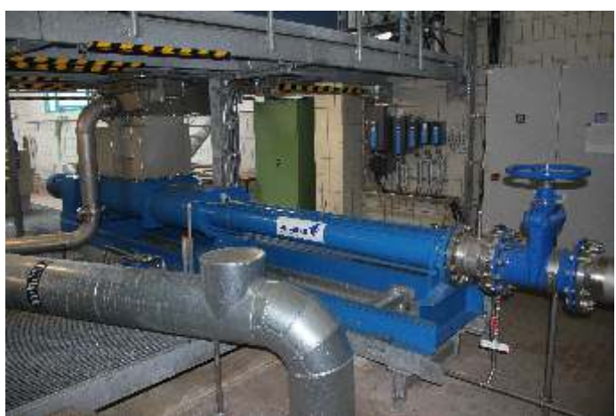
Four-stage solid-substance progressive cavity pump, type AE4N1450-RG from Allweiler®, used as residual sludge discharge pump, below the centrifuge.