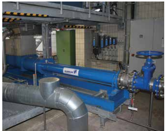
Figure 4: Four-stage solid-substance progressive cavity pump, used as a residual sludge discharge pump below the centrifuge.

In addition to lower energy consumption, the plant has also reduced its spare parts and maintenance costs. As there is a large selection of rotors and stator elastomers operators can find the combination that best matches the pumped liquid's chemical and physical characteristics. This results in the longest possible service life; long maintenance intervals, minimal downtime and very reliable, continuous operations.