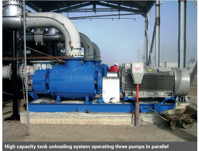
High capacity tank unloading system operating three pumps in parallel

The flexibility in design of the pump system for handling a variety of feedstocks positions allows the refinery to respond to fluctuating market conditions, and to take advantage of rail-transported domestic shale and heavy Canadian crude oils for many years to come. From conceptualisation through to overcoming facility start-up challenges,