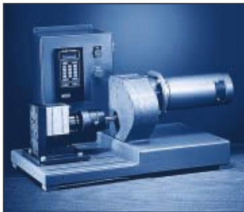
Standard ZeDRIVE with 1/2 hp QM and rear-port HMB pumps.

today—diaphragm, lobe, coarse gear, piston, plunger, and screw pumps. Each had problems with pulsation, flow inaccuracies, multiple seal areas and slippage, which required constant calibration, high maintenance, and extended downtimes.